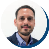
Simon Bisegger (Switzerland)