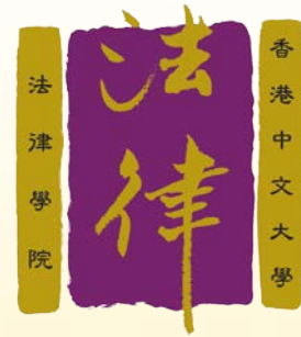
Faculty of Law The Chinese University of Hong Kong

All the rooms are equipped with state-of-the-art facilities, including LCD projectors with projector screen, plasma panel, built-in computer with LCD writing panel, visual presenter, DVD/VHS/Cassette player, digital wireless microphones, lectern, whiteboard and other standard facilities.